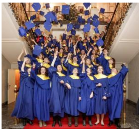
3 rd graduation ceremony of MSC, 12 th December 2014 in Brussels at the Royal Flemish Academy of Belgium for Science and the Arts.

A protocol was signed by MSC, ECTN and EuCheMS stressing the active cooperation observed along the past years and strengthening new forms of future collaboration.