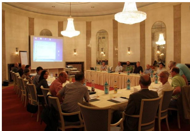
13th Annual meeting of the Subcommittee on Solubility and Equilibrium Data on the 20th July 2014, in Karlsruhe, Germany