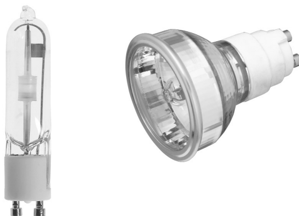
Fig. 1b CMH 20-W Supermini lamp in single-ended and precise MR16 finish.

In HID lamps, the photons used for lighting are emitted from a discharge plasma generated between two electrodes. Figure 2 shows the schematics of HID lamps. The major parts—the electrodes, the elements of the discharge, the ceramic arc tube, and the sealing in-between the arc tube and electric feedthrough—are shown. Although grouping of the research activities is not easy or almost impossible due to the interactions between the phenomena of the different areas, this paper describes and takes examples from the following key science and technology areas of the HID light sources: plasma physics and discharge chemistry, electrodes, ceramics. Other important areas of the lighting will not be covered.