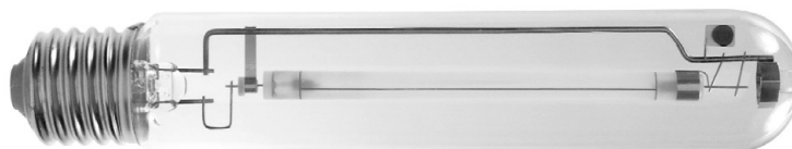
Fig. 1a Lucalox XO HPS lamp.

High-intensity discharge (HID) lamps play a major role in today's lighting. The two major families: the high-pressure sodium (HPS) lamp and the ceramic metal halide (CMH) lamp provide a wide range of luminous efficacy (up to 150 lumen/W, HPS) or excellent color-rendering index ( R_a = 90+ , CMH). The former offers very efficient lighting with acceptable color, hence they are used mainly in public, road, or industrial lighting. The latter offers excellent color, and application areas are decorative lighting of buildings, shops, and offices, both in exterior as well as interior applications. Examples of the two families can be seen in Fig. 1.