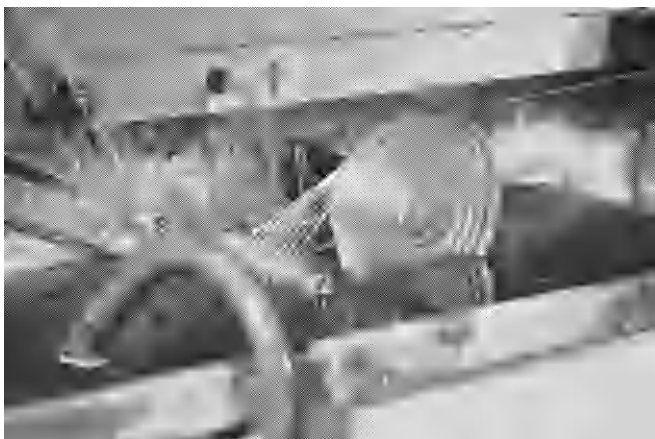
Figure 2. Stretching arrangements used in making Polynosic rayon