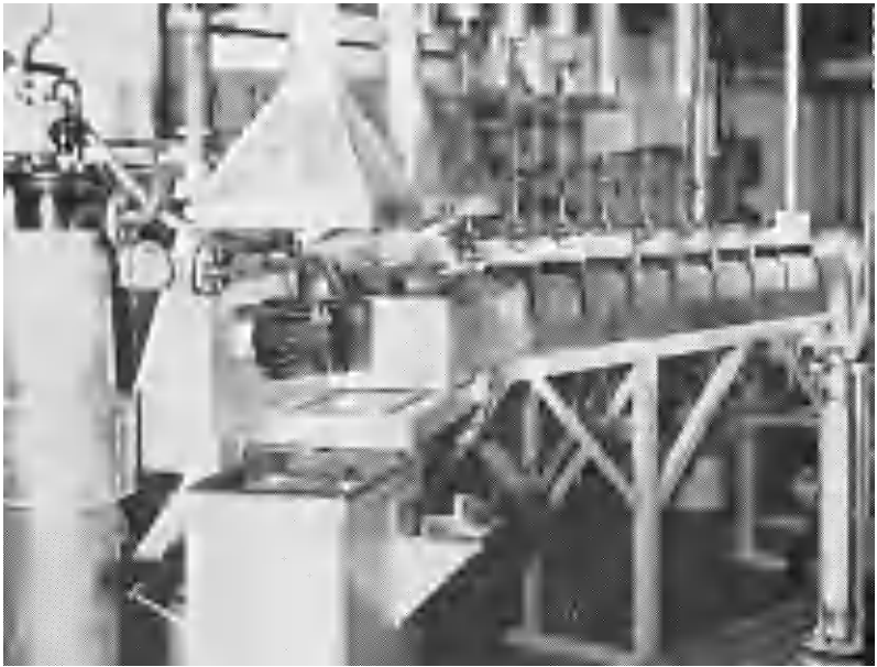
Figure 1. Polynosic spinning machine